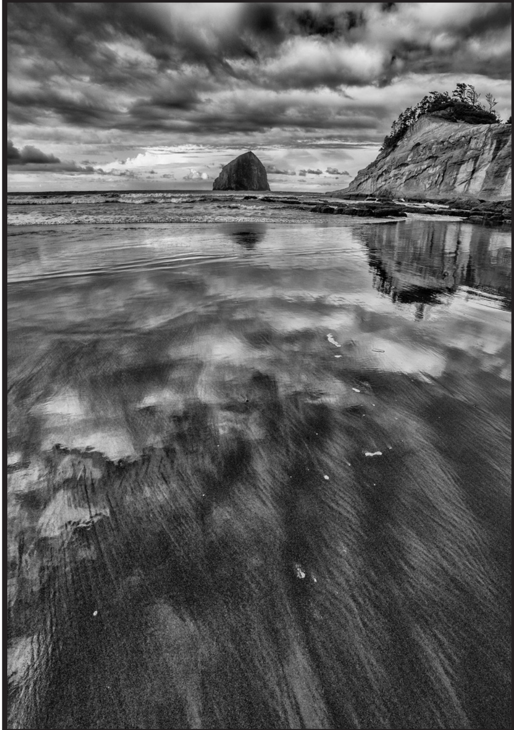
Haystack and Cape Kiwanda, Pacific City OR