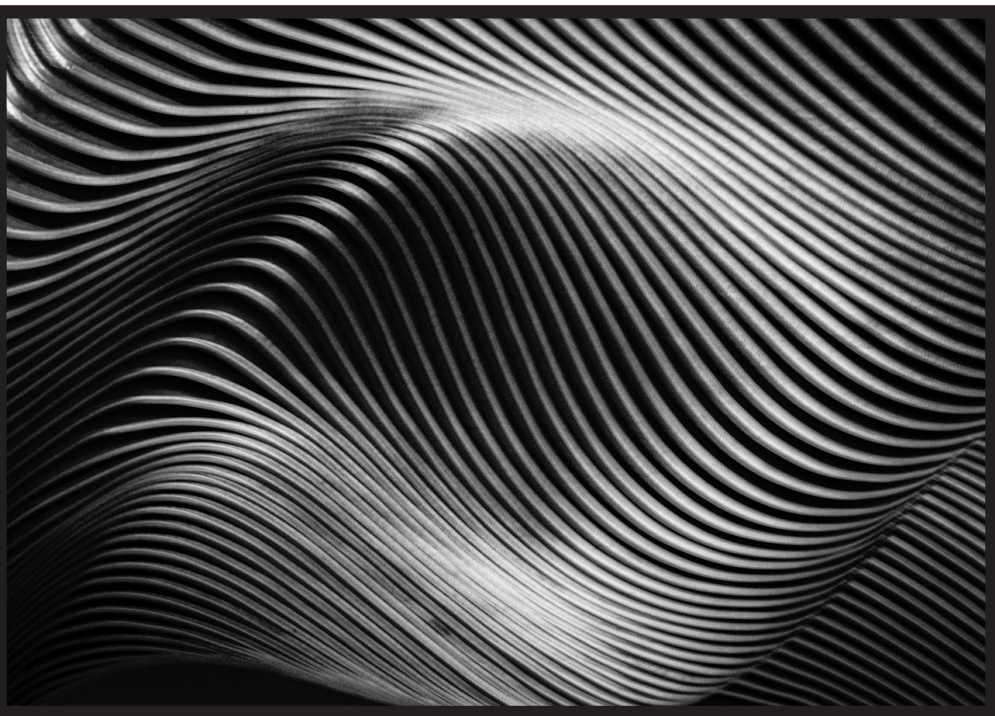
Brass Slice Chair