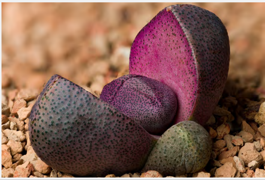
Pleispilos "Royal Flush"