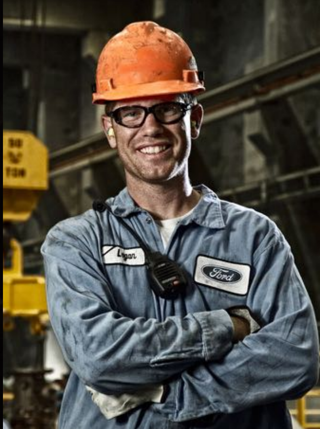
Just some of Will's Portraits